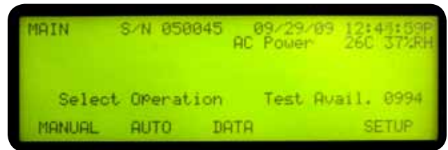
The Model 280A CPM displays an easy to view LCD screen for tracking of your operating parameters. Users can set the test parameters all by the simple push of a button.

The charge plate is detachable, and has a variety of mounting options. A 6" charge plate comes standard with unit and a 1" charge plate is available for environments where space is limited and the application does not require strict adherence to the ESDA Standard SMT3.1 for usage of a 6" charge plate. These options provide flexibility and ease-of-use in a variety of environments, including mini-environments.